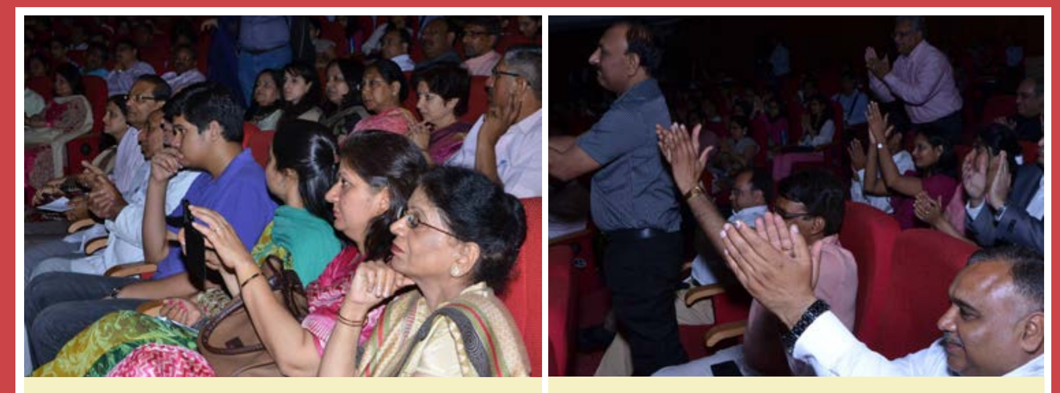
An auditorium full of "Basicolans"

The early hours of the evening on the 28th March saw lots of Alumni, members of the college staff and their families gradually making their way to the Stein